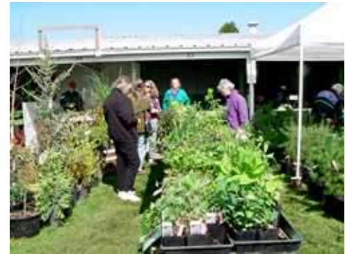
Admiring visitors at the Festival of Trees