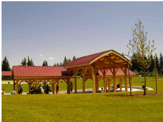
Crossroads Pavilion, Bellevue, Washington

As bents were raised and heavy timbers were secured with mortise and tenon joinery and hardwood pegs, framers enjoyed demonstrating a different kind of 21st century technology in the community that spawned Microsoft.