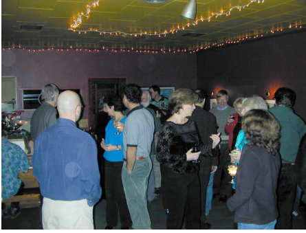
Timbercraft Christmas party 2004