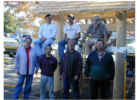
Japanese Gate and Volunteer Timber Framers