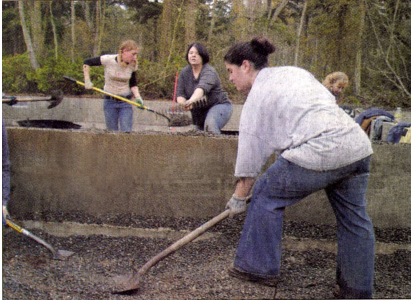
Future home owners working on a foundation -part of the Kitsap Housing Authority project.